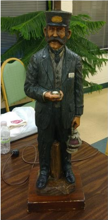
Here are some of the Show & Tell items on display at the June Div 6 meeting!