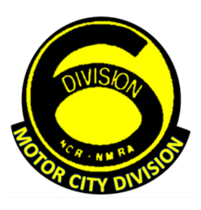
OFFICIAL NEWSLETTER OF DIVISION SIX OF THE NORTH CENTRAL REGION OF THE NATIONAL MODEL RAILROAD ASSOCIATION