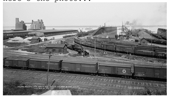
WOW!! So much to learn from one photo...! Thanks John! Looking forward to another soon!