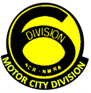
OFFICIAL NEWSLETTER OF DIVISION SIX OF THE NORTH CENTRAL REGION OF THE NATIONAL MODEL RAILROAD ASSOCIATION